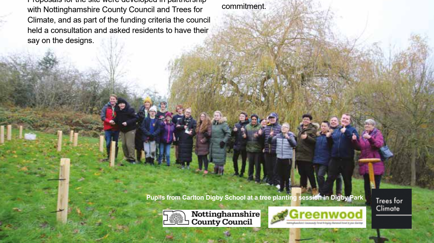
Pupils from Carlton Digby School at a tree planting session in Digby Park

Gedling Borough Council has made a pledge to become net zero carbon by 2030 and this scheme will make an important contribution to this commitment.