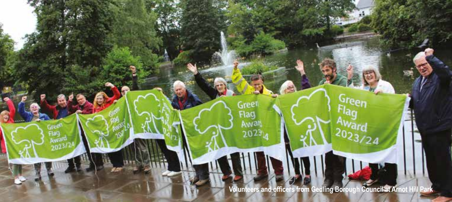
Volunteers and officers from Gedling Borough Council at Arnot Hill Park